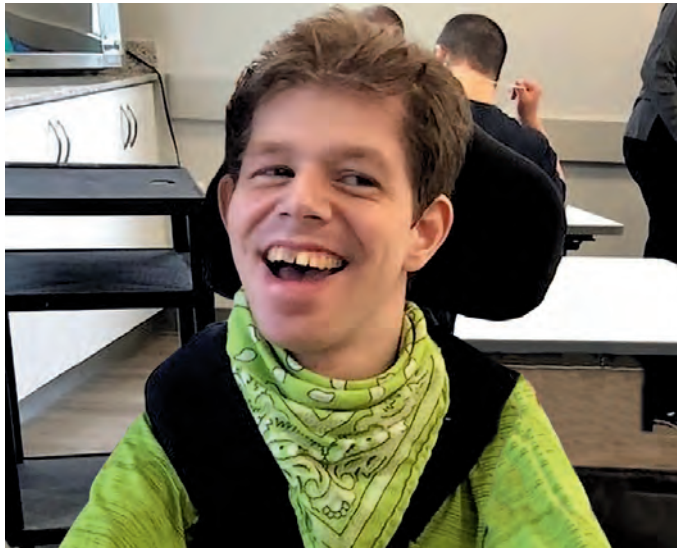
JOSEPH © ALL PHOTOS COURTESY OF META CENTRE

For more information and to support, please visit metacentre.ca